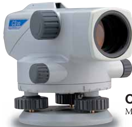
C300 Magnification 28x

All C3 models meet JIS grade 4 specification for waterproofing (this complies with International Electrotechnical Commission Standard, Class IPX4).