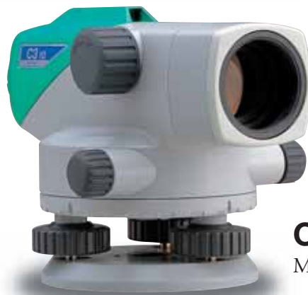
C310 Magnification 26x