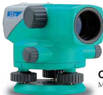
C320 Magnification 24x