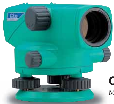
C330 Magnification 22x